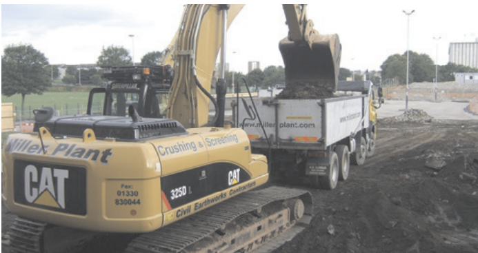
Digging in: The company starts on its earthworks contract for the Queen Mother Library.

It would seem that early morning starts will be on the cards for some time at the Miller family.